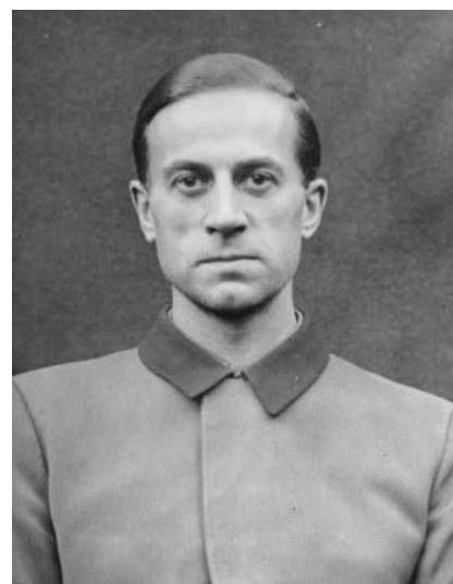
FIG 3 Karl Brandt. Hitler's personal physician and Professor of Psychiatry at Würzburg University, Brandt promoted the T-4 euthanasia programme. He was sentenced to death at the Nuremberg Trials.

Although psychiatrists were not the only health professionals involved in abuses of mentally ill people in Nazi Germany, many reports indicate it was not a minority activity among them. Indeed, it is likely that a majority of practising psychiatrists in Germany at the time supported the Nazi regime and a large proportion identified their patients for the T-4 euthanasia programme. Similarly, many American psychiatrists and academics, such as Robert Foster Kennedy, supported Hitler's euthanasia campaigns. In an editorial in the